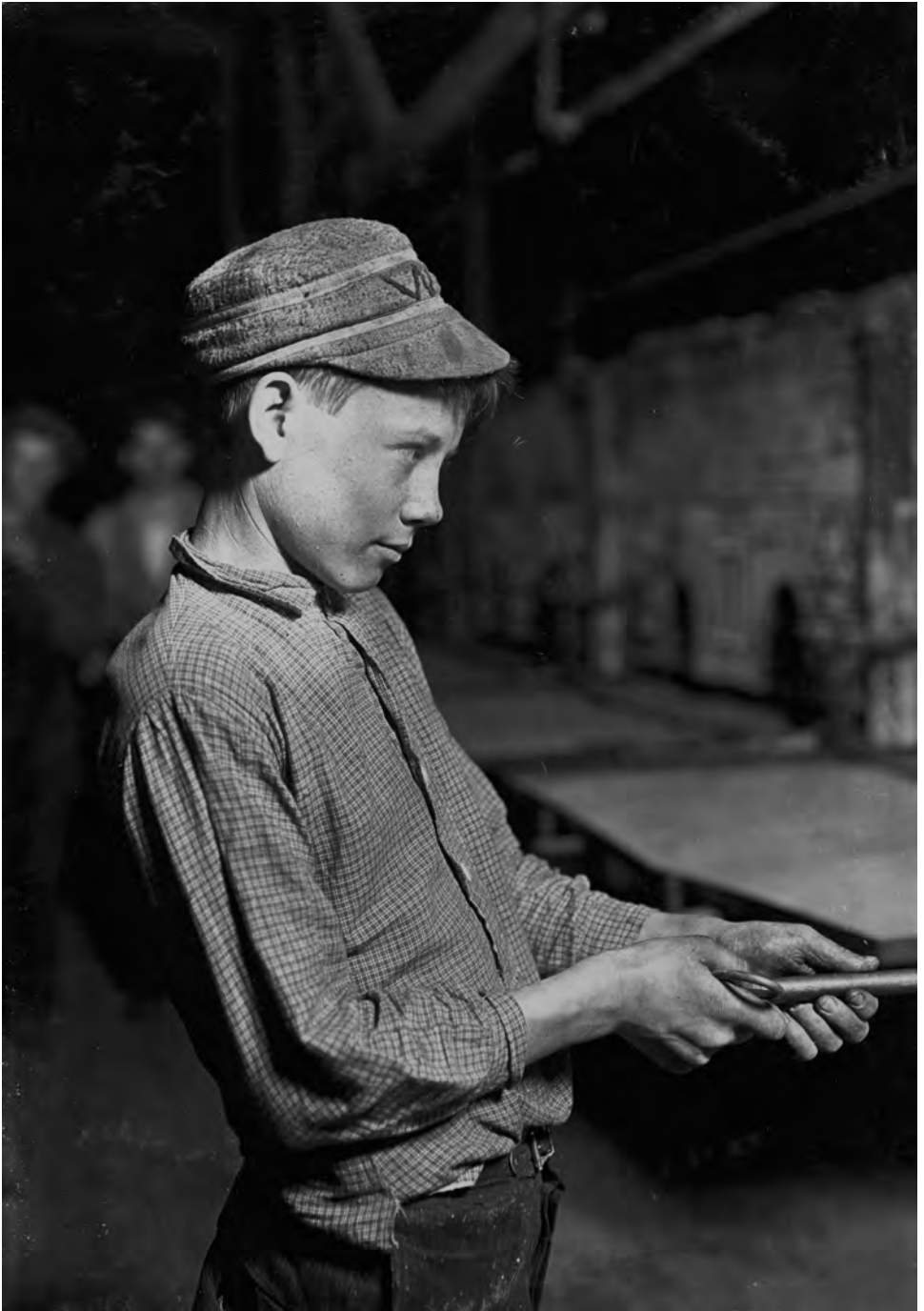
A fifteen-year-old "carry-in boy" at the annealing furnace, 1908.