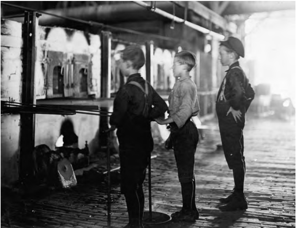
Boys at the lehr, 1908.

apprenticeship and journeyman study. A blower apprenticeship, because it led to the highest-paid position, was difficult to enter. The blower apprentice was usually part of a blower's or manager's family. Sometimes, as with Michael Owens, a hardworking "boy" might be selected as an apprentice. The acceptance, time in learning the trade, and requirements of apprentices were set by a combination of management, union, and masters that varied by company. These guidelines were a constant matter of debate and struggle between the union and management. Once accepted, he might apprentice for five to six years to obtain journeyman status, which might require another five years before he became a blower. An apprentice was paid half as much as a journeyman but after a year was as productive.