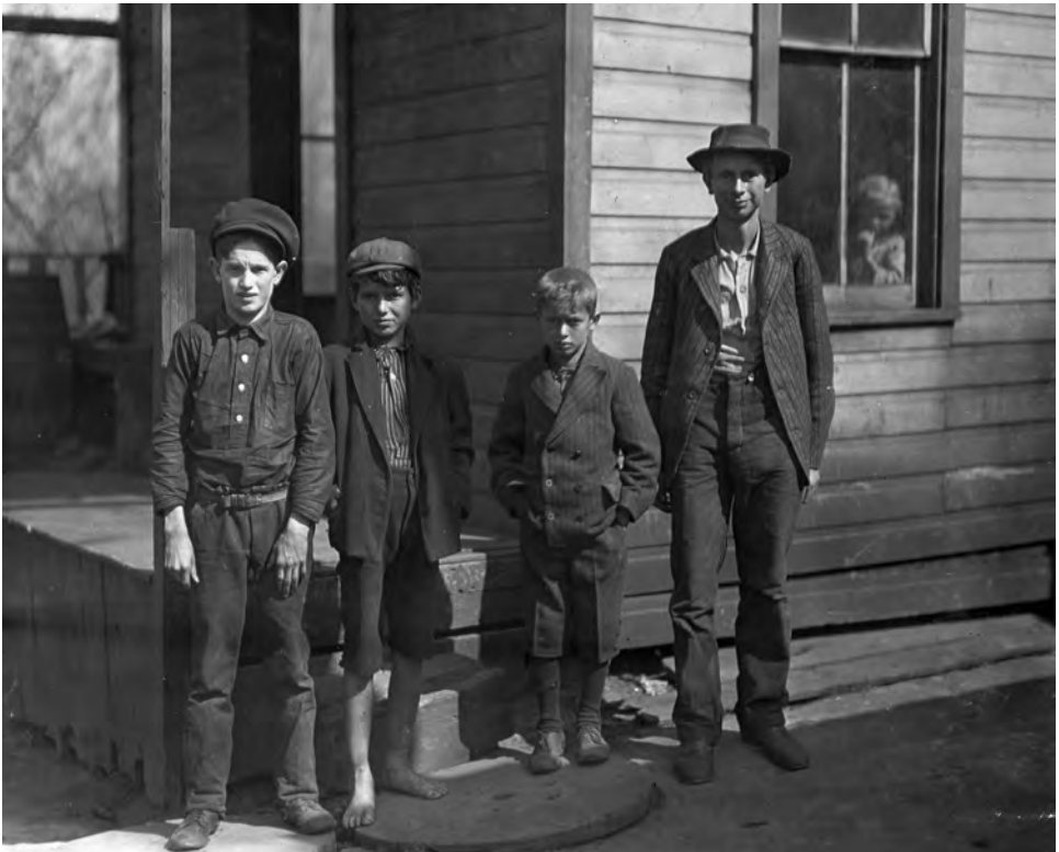
Three boys and their father, all of whom worked at a West Virginia glass factory, 1908.

Henry Heinz started to bottle catsup during this period as well. Another application was fruit jars, which started to prosper with the invention of the Mason jar in 1858. The Mason jar used a